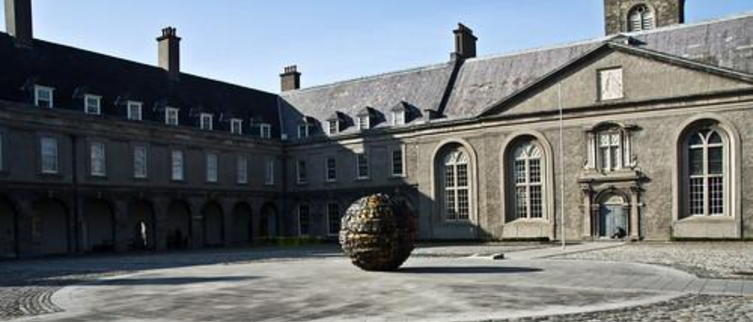
The Irish Emigration Museum