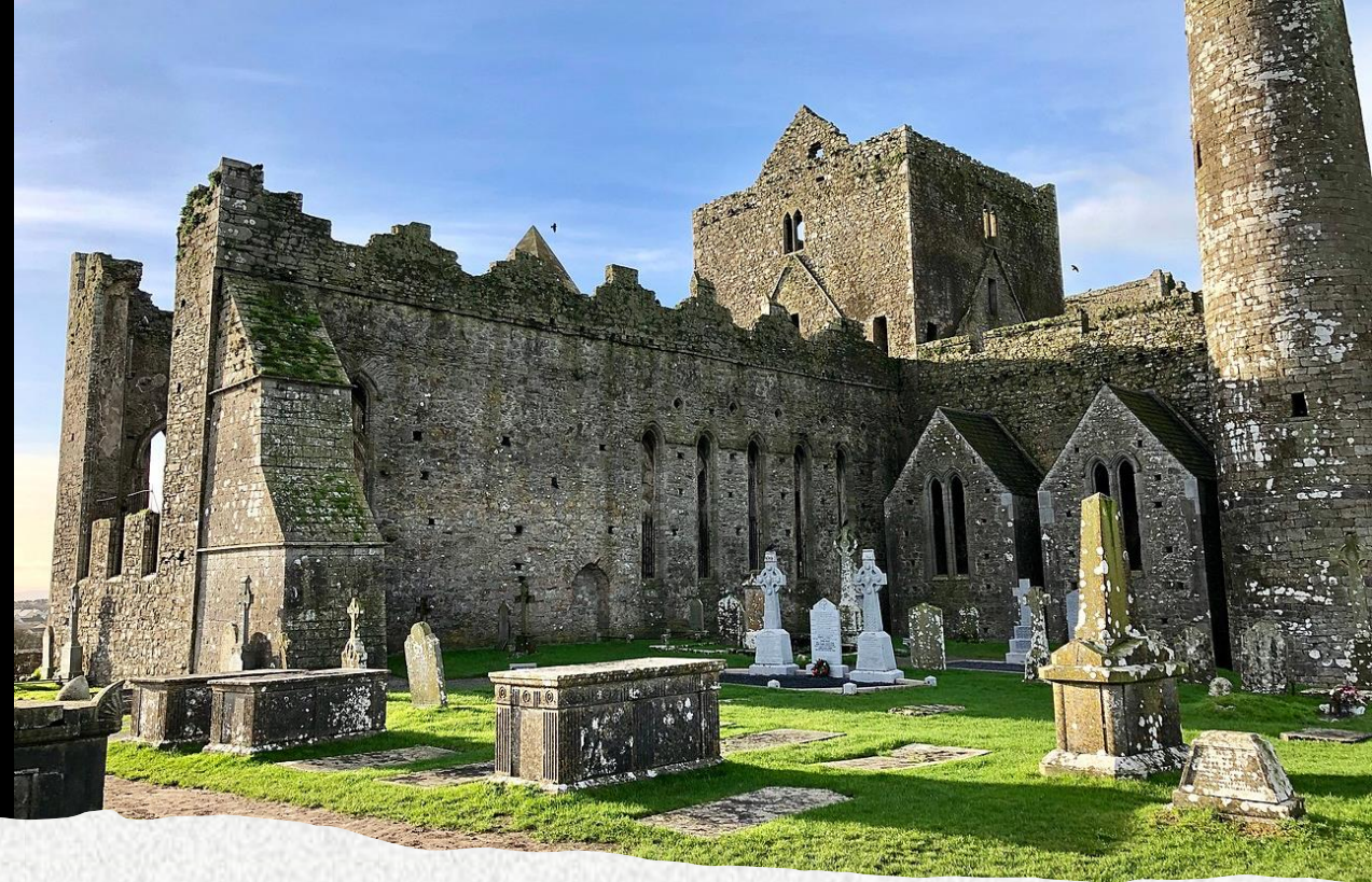
Rock of Cashel